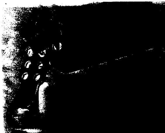
FIGURE 2 (HASP, LOCK, TAG, COMBINATION)