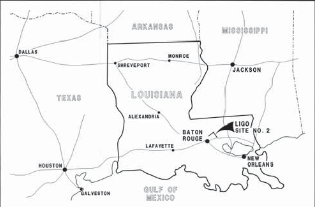
SITE NO. 2 LIVINGSTON, LOUISIANA