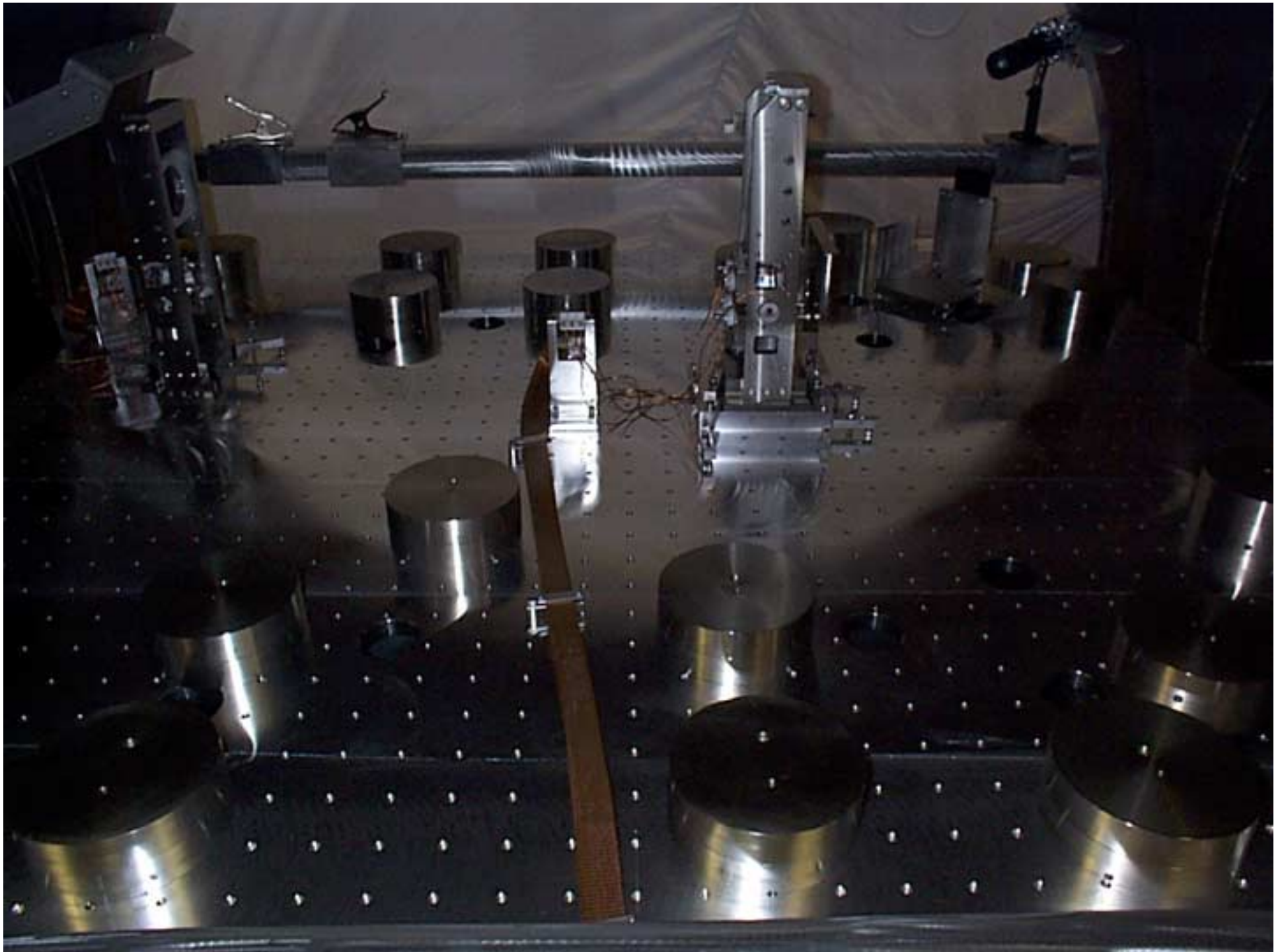
WHAM 8 May 19, 2000: 460. central portion, +X @ right