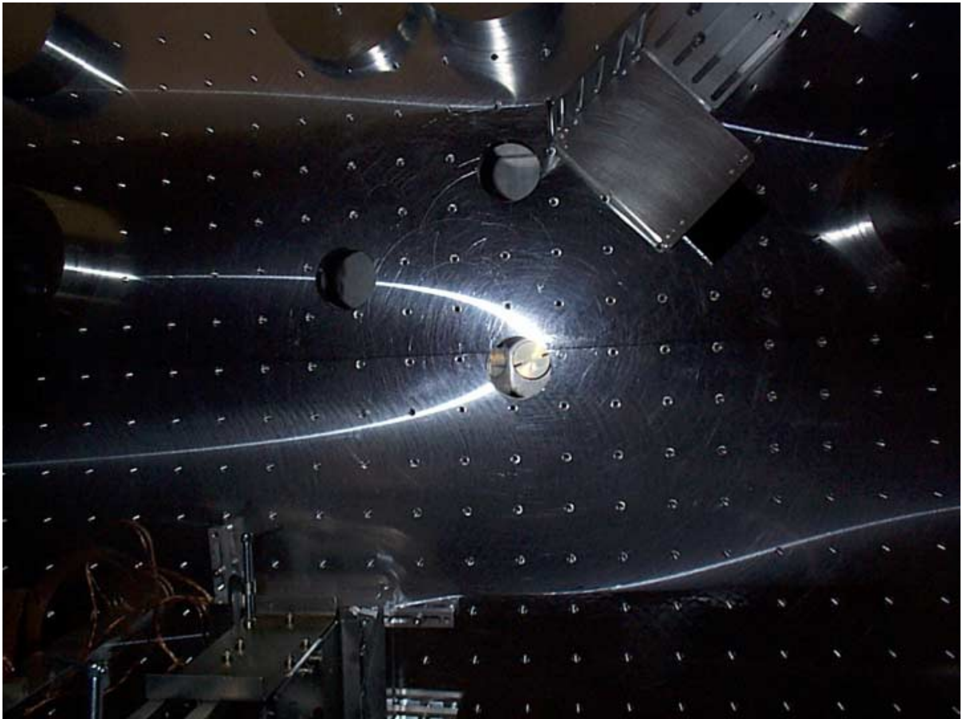
WHAM 8 May 19, 2000: 464. NW quadrant, +X @ right