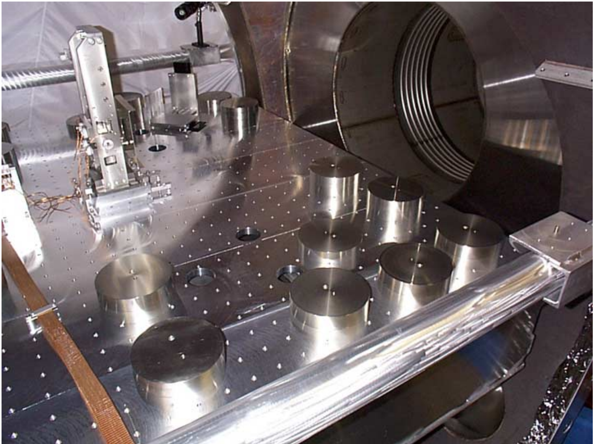
WHAM 8 May 19, 2000: 461. north end, +X @ right