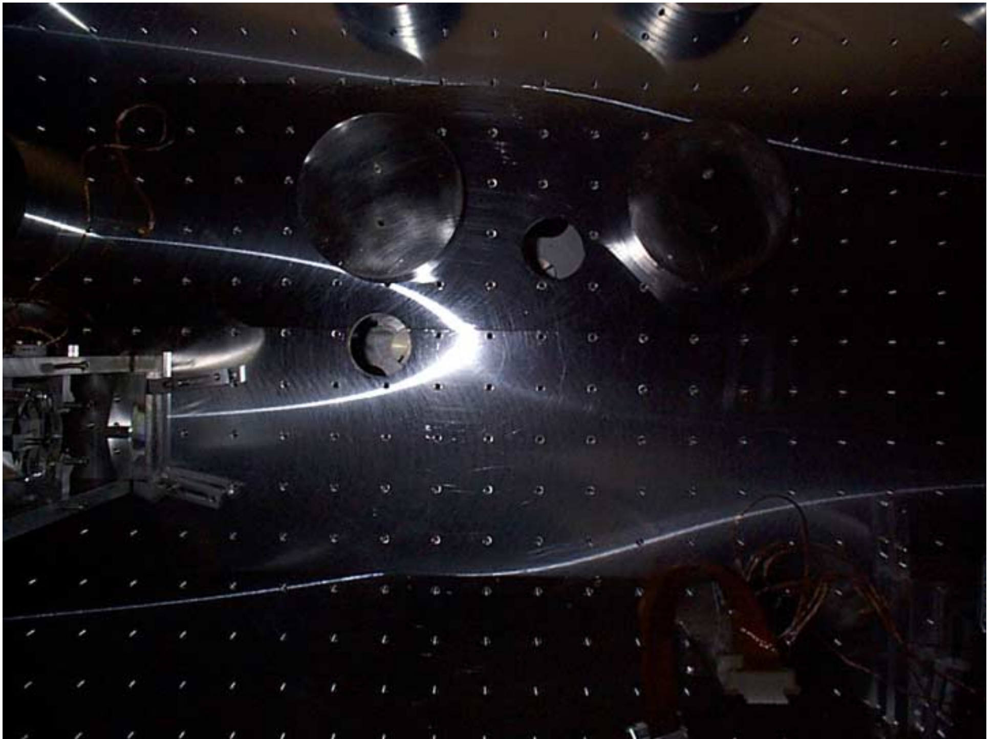
WHAM 8 May 19, 2000: 462. SW quadrant, +X @ right