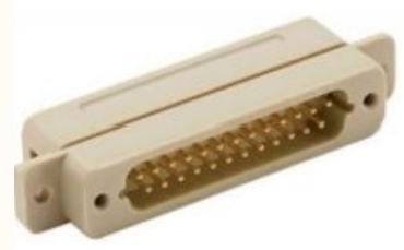
J1 - UHV Connector 25D Male PEEK PN 100421